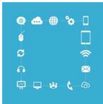
End to End IOT