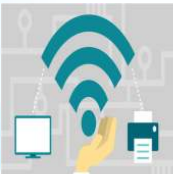
High Performance Wireless