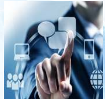
IOT in a Box